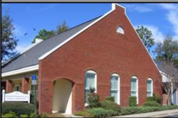
Allergy and Immunology