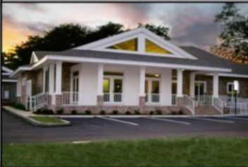
Spanish Trail Dentistry